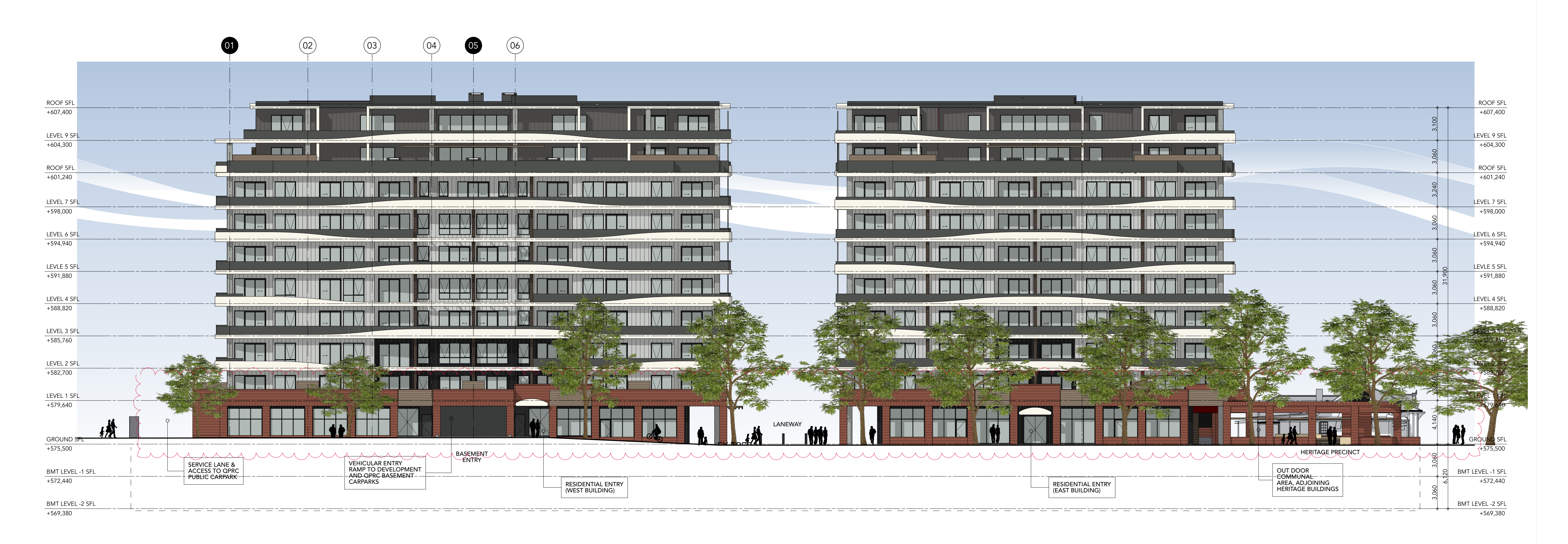
ELEVATION - B. SOUTH-EAST