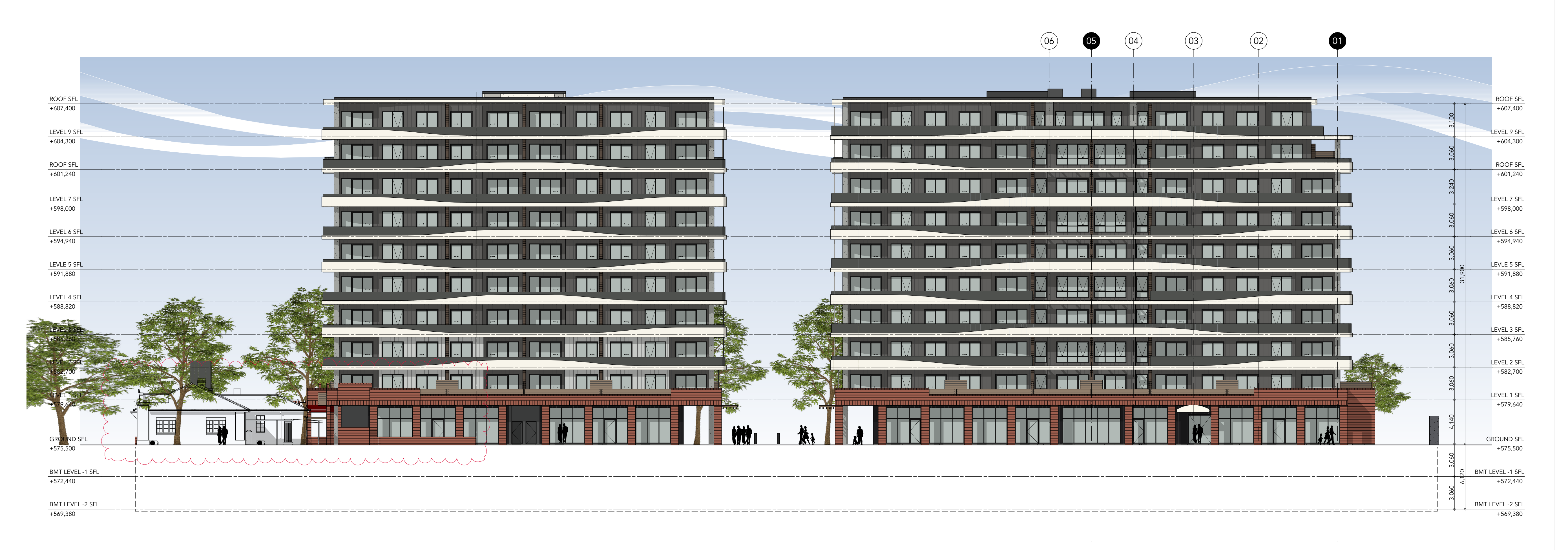
ELEVATION - D. NORTH-WEST